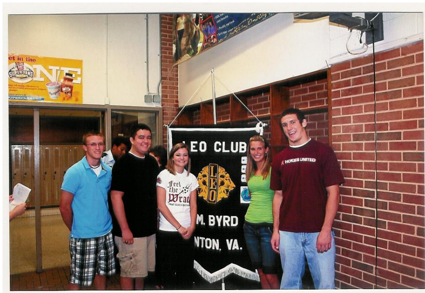
Officers of William Byrd Leo Club 2008-2009

On September 16, 2008 the William Byrd Leo Club held a recruiting campaign during the four lunch periods at the school. The final count in new members was 125. I think this was an outstanding effort by an outstanding Leo Club.