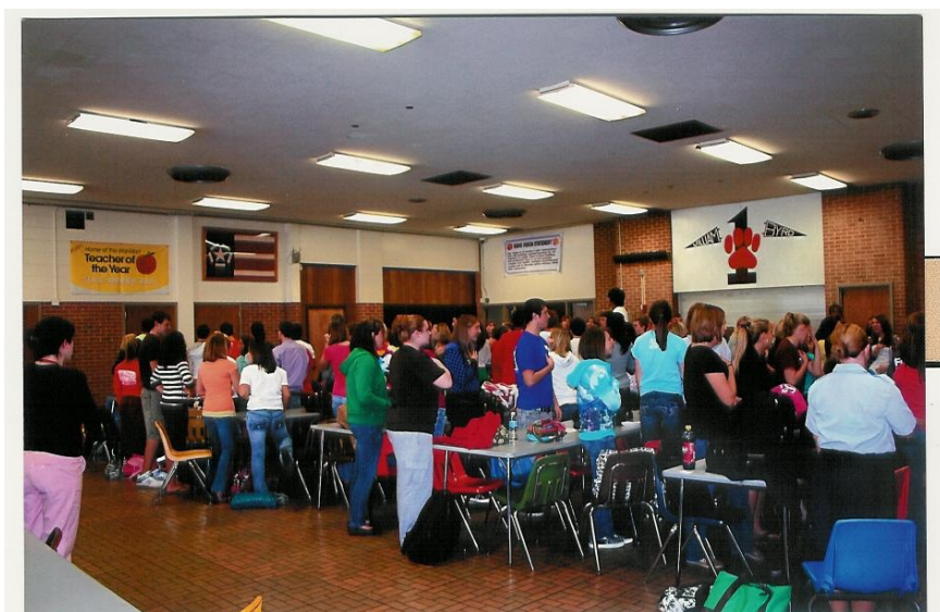
Leo Club Meeting September 24, 2008 with opening ceremony by pledging allegiance to the flag