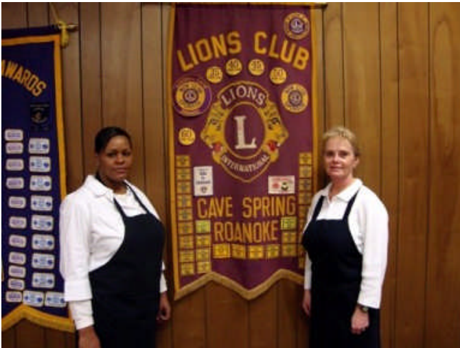
ADELL'S CATERING STAFF

Buffet served by Adell's Catering Entertainment by Salem Singers of Salem High School