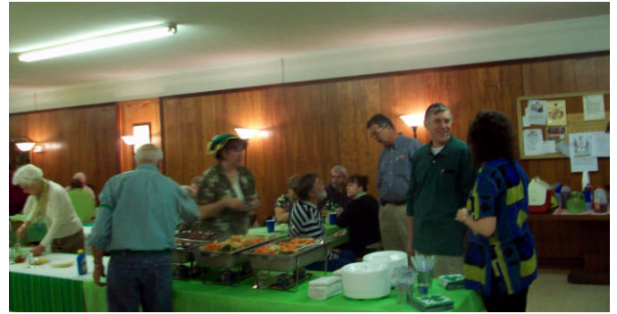
Above: St. Patrick's Day Social