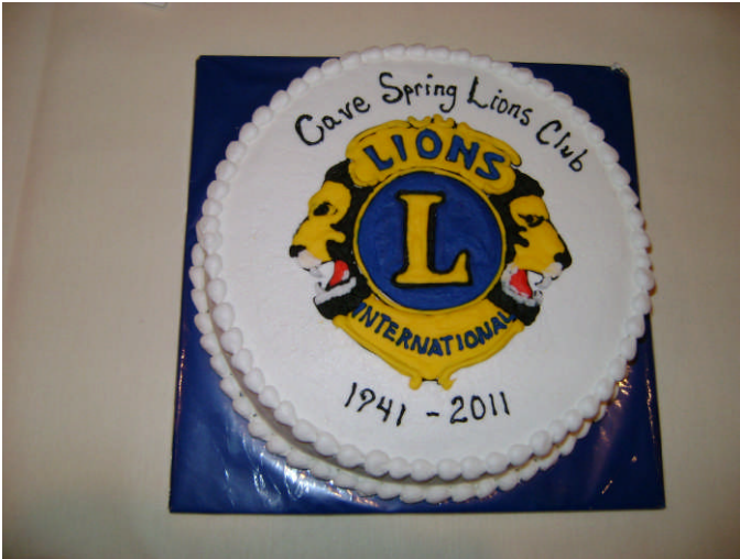
Lion's Birthday Cake