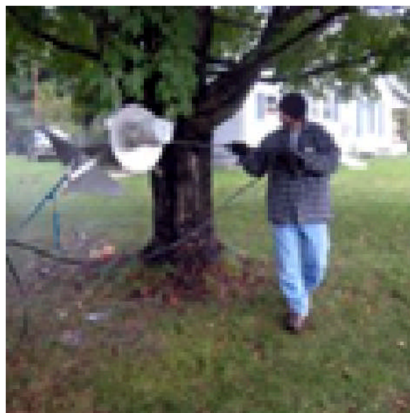
Electric stirrer being pressure-washed