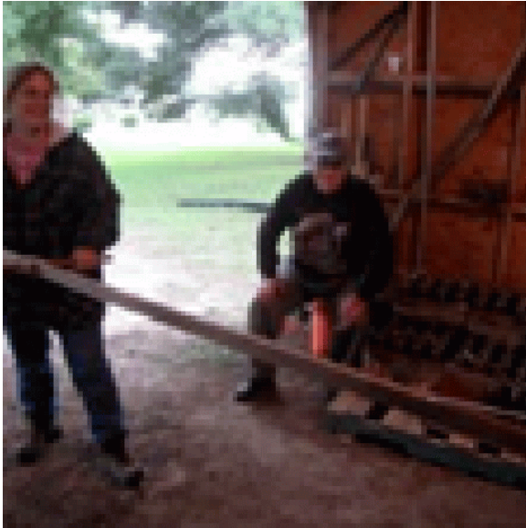
The Old-fashioned Way