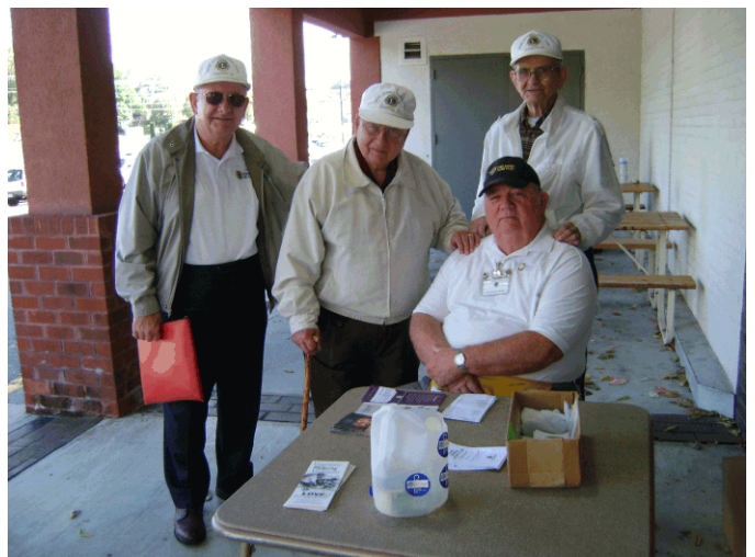
Cave Spring Lions collect for White Cane