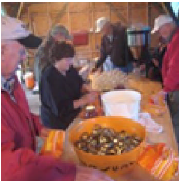
Start filling the jars