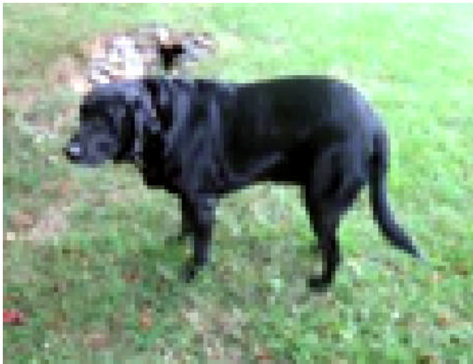
Our constant companion