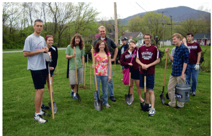
Assisted by students from Roanoke College