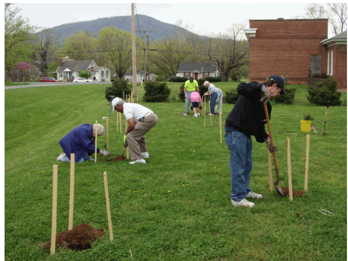
Planting 50 trees at Penn Forest Elementary School