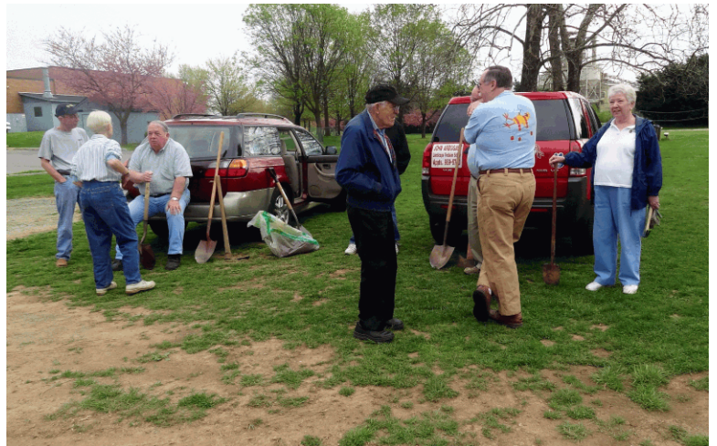
Cave Spring Lions hard at work