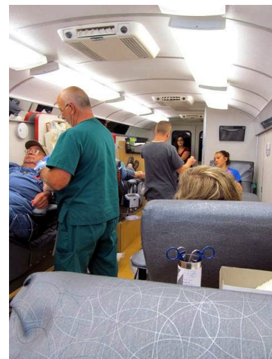
Right: The "Big Red Bus" was a busy place at the Newport Agricultural Fair on August 10 th

For the third year the United Methodist Women at Pembroke United Methodist Church sponsored a Back To School Bazaar to assist the needy families of Giles County with supplying the ever growing, and ever more expensive needs of a child going back to school. This year saw just over 300 children from all over Giles County attend the event. The children received backpacks personalized with everything they will need for their specific school and class. Volunteers came from throughout the area to assist. Donations came from individuals as well as corporations in Giles County.