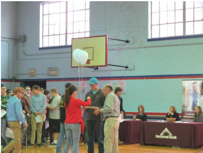
Left- One young man learns that he has just become the father of twin boys!