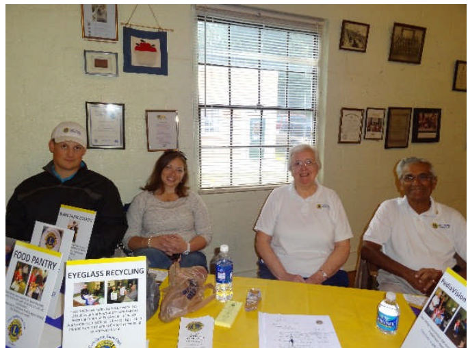
SPOT Workers at Boones Mill Apple Festival