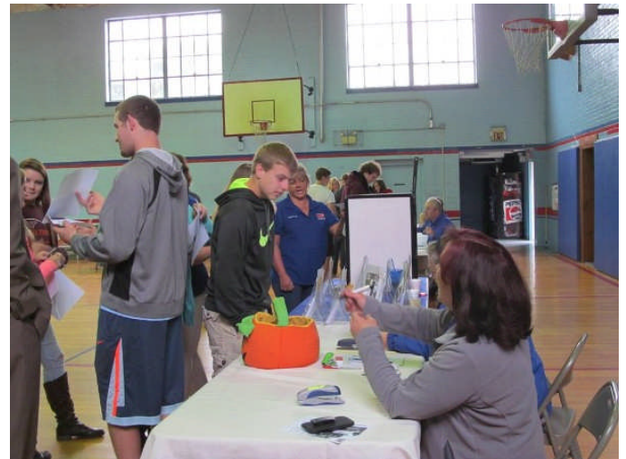
Right- Students wait in line to find suitable as well as affordable housing for themselves and their families.