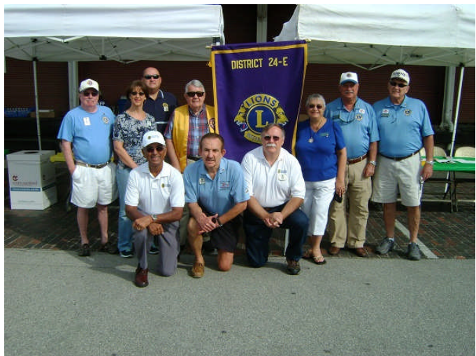
JDRF Walk Volunteers