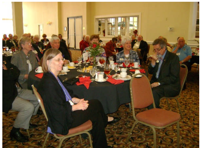
First Lady Babs Newman