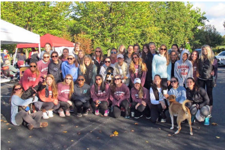
Delta Gamma group

The Blacksburg Host Lions Club and the Delta Gamma Sorority at Virginia Tech are co-sponsors of the Walk-a-Thon.