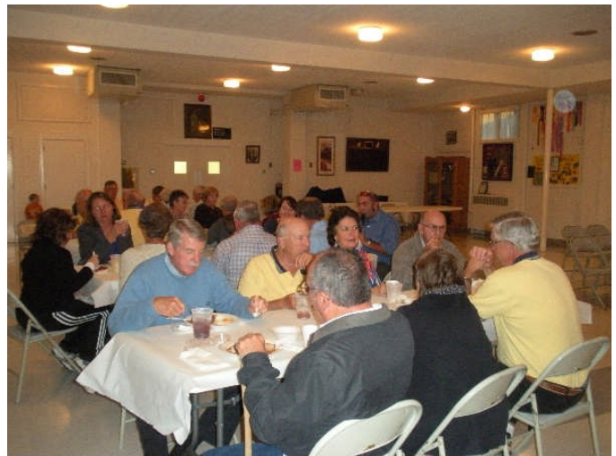
The gathering of Lions at the "ole feed bag" enjoying Lionism at its best.