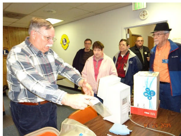
A tour of the Eye Bank