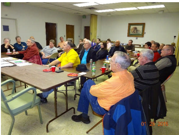
A well attended meeting