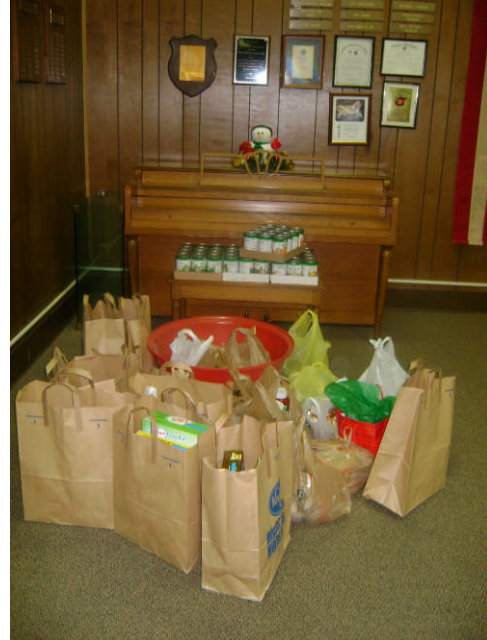
260 lbs. of food was donated to the Food Pantry from the Christmas Party.