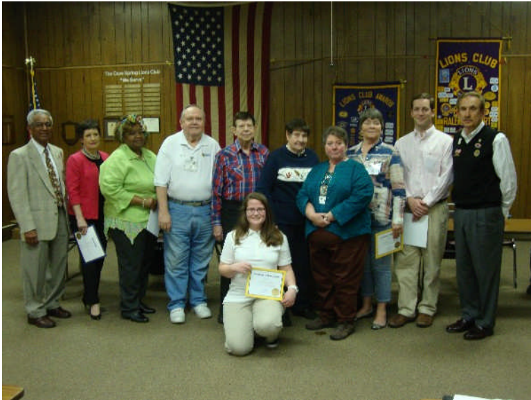
New Members of the Cave Spring Lions Club