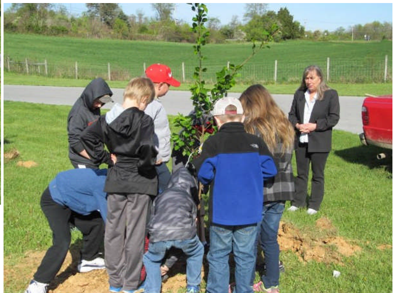
2 nd grade students help fill the holes around the new trees

This year six Yoshina Cherry trees were planted around the front lawn of the school. Each year the trees grow and each year Giles Lions Club members run into children who stop them to say "you're the man/lady who read to us and planted trees with us".